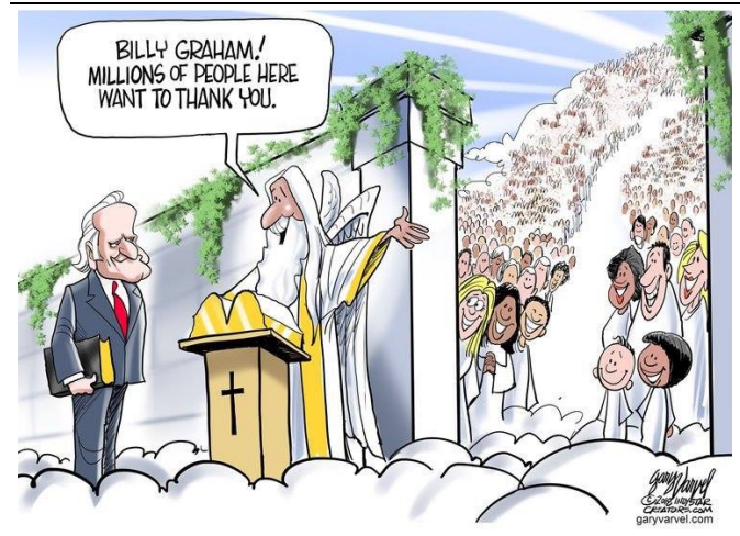
Cartoon submitted by Cynthia Ward.