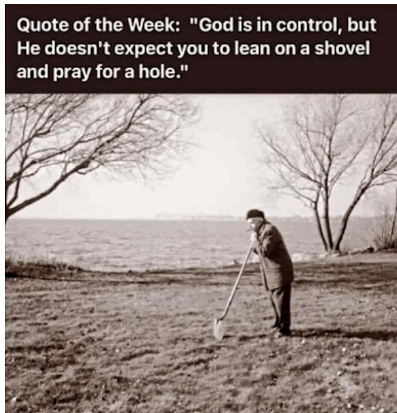
Graphics are courtesy of Tom Cairns