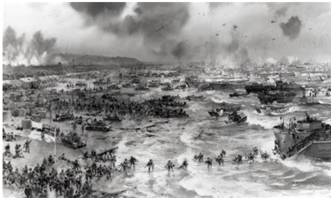
Photo showing the enormity of the battle.