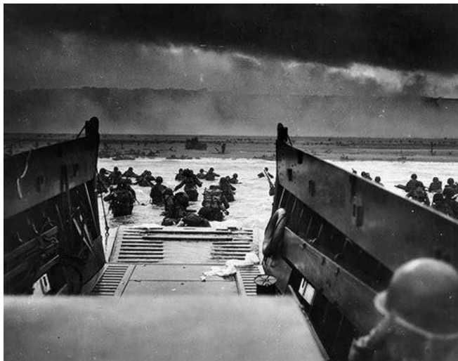
Troops heading into the thick of the battle.

In his bestselling history, D-Day , historian Stephen Ambrose chronicled the most significant day of the 20th century. It was a day of courage and heroism, fear and determination, and what General Dwight Eisenhower called “the fury of an aroused democracy.”