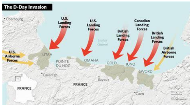
The Allied forces and the targeted beaches.